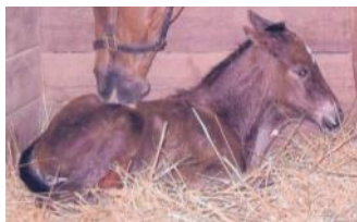
Adarnas just a few hours old