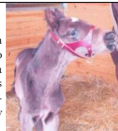
Meteor Shot as newborn