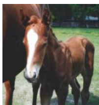
Lash as a newborn