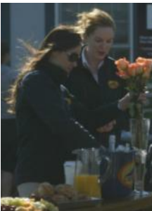
Cavalor served champagne and chocolates!